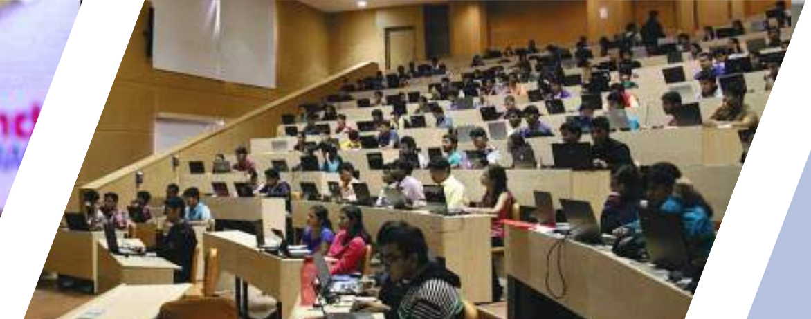
Ideates & Case Competitions