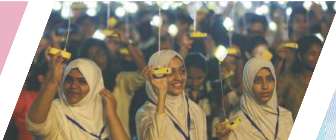
Student Ambassador Program