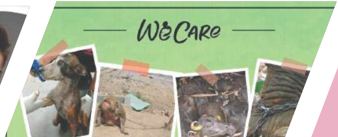
We Care Initiative

70+ Schools | 10 major NGO's | 10000+ students