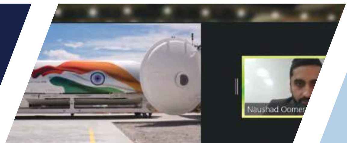
Virgin Hyperloop India