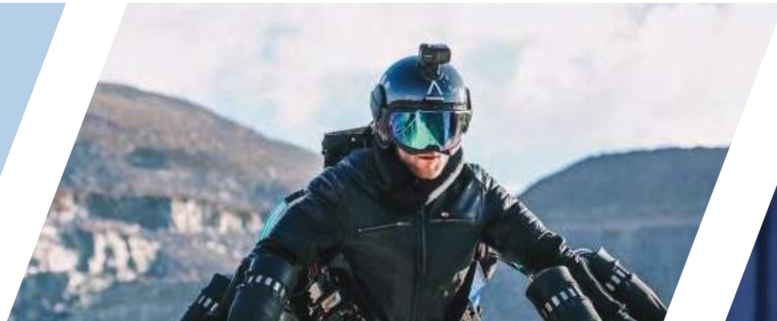
Gravity Industries UK