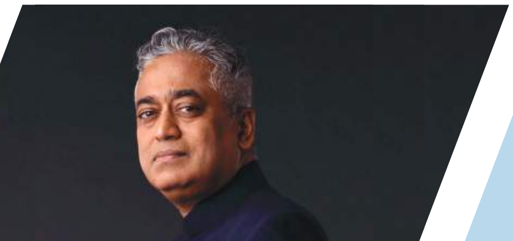
Rajdeep Sardesai Editor, India Today