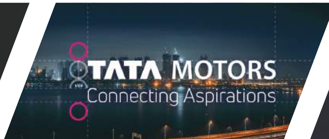
Branding Through Video Ads