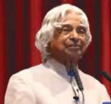
Late Dr. A.P.J. Abdul Kalam Former President of India