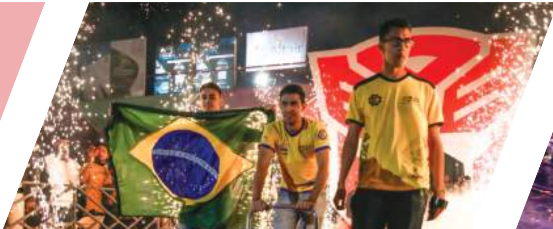
International Teams From 25+ Countries