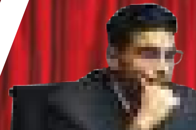
Vishwanathan Anand Chess Grandmaster