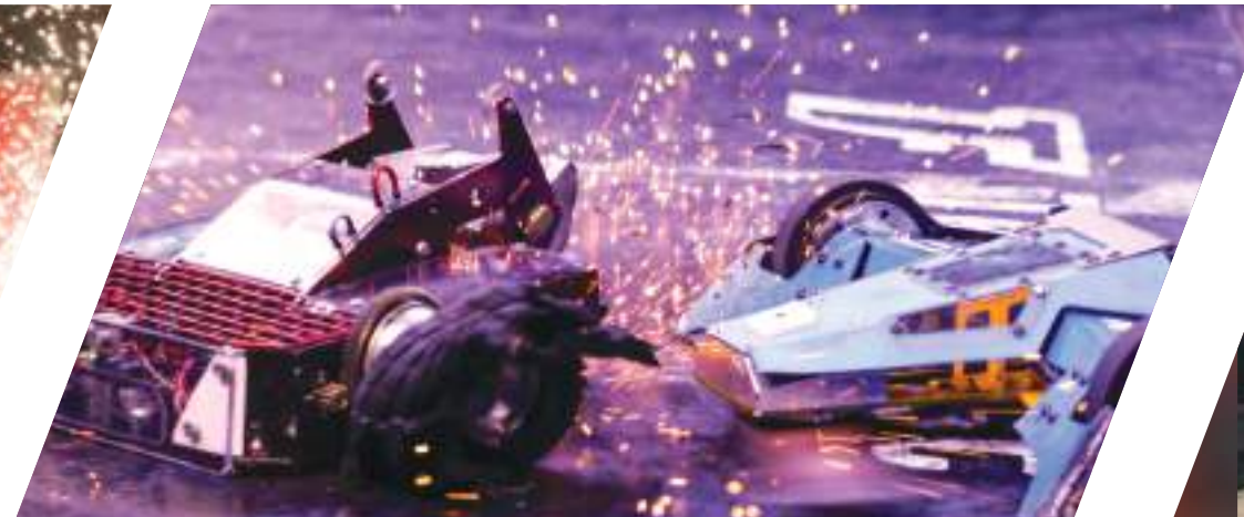
Face-Off Sparks fly as metal crushes metal