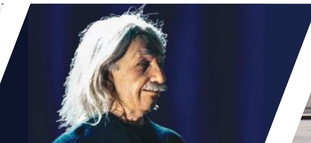
Einstein Robot Hanson Robotics, Hong Kong