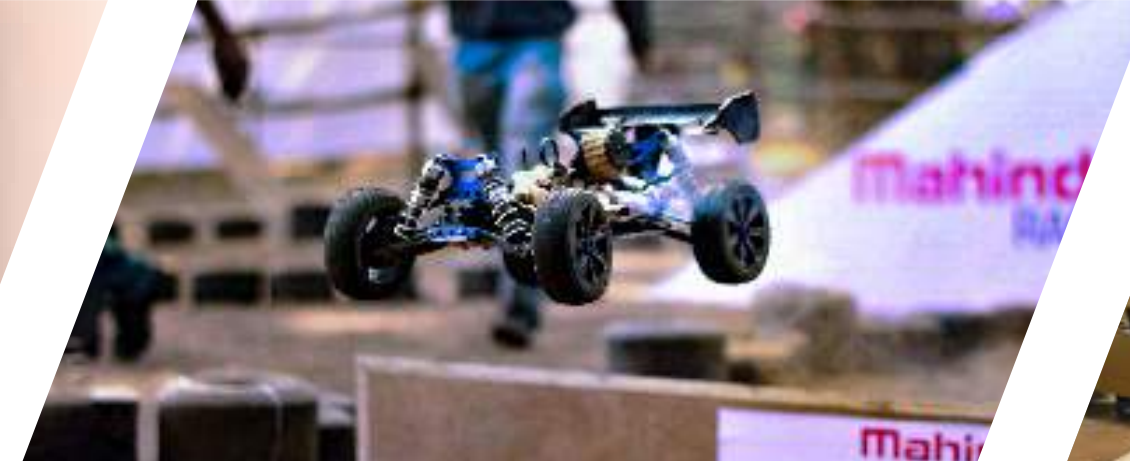
International Full Throttle