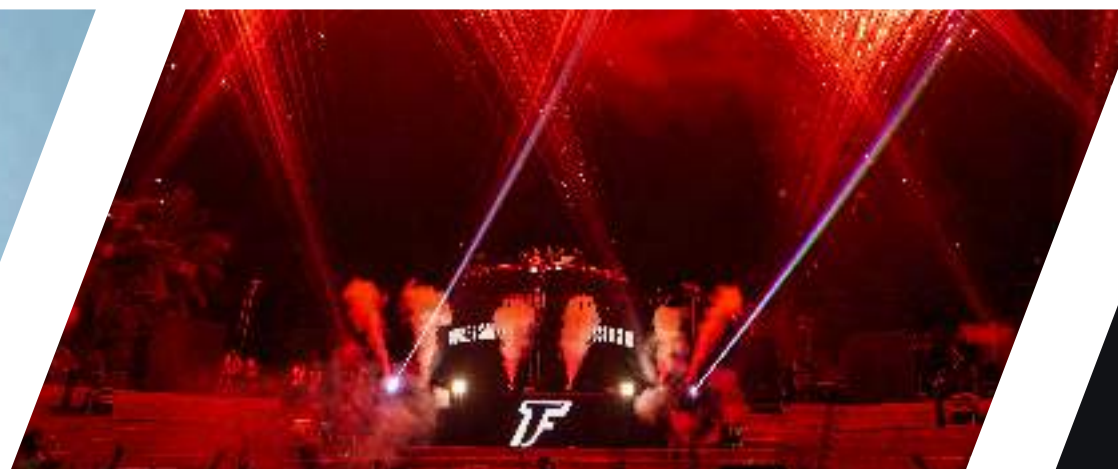
India's first 360° EDM concert IIT Bombay