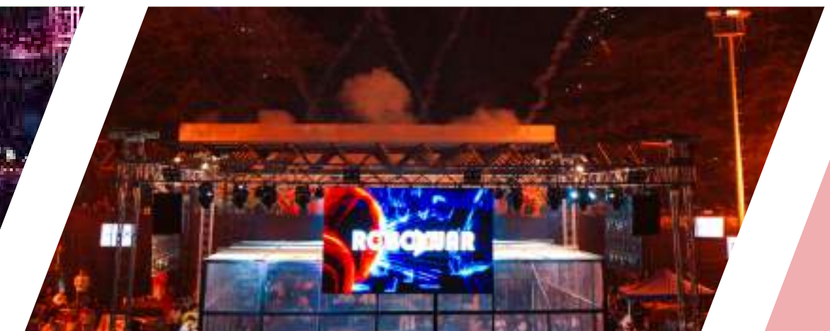
Robowars Cage IIT Bombay