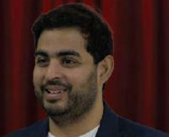
Shri Akash Ambani Chairman, Reliance JIO