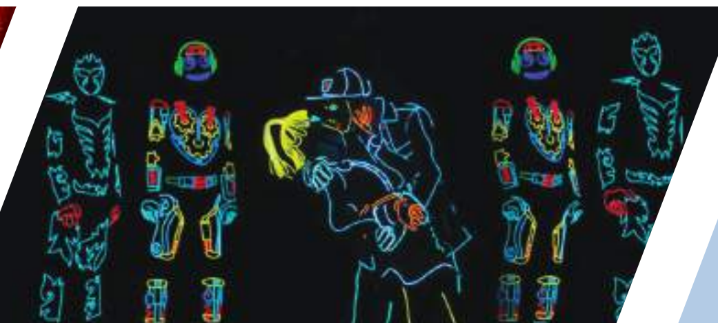
Light Balance Lightup Troupe