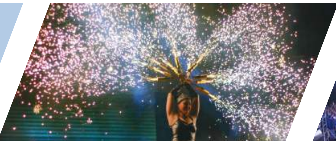
Viduramzai Fire show, Lithuania