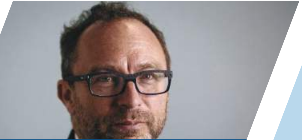
Jimmy Wales Co-founder Wikipedia