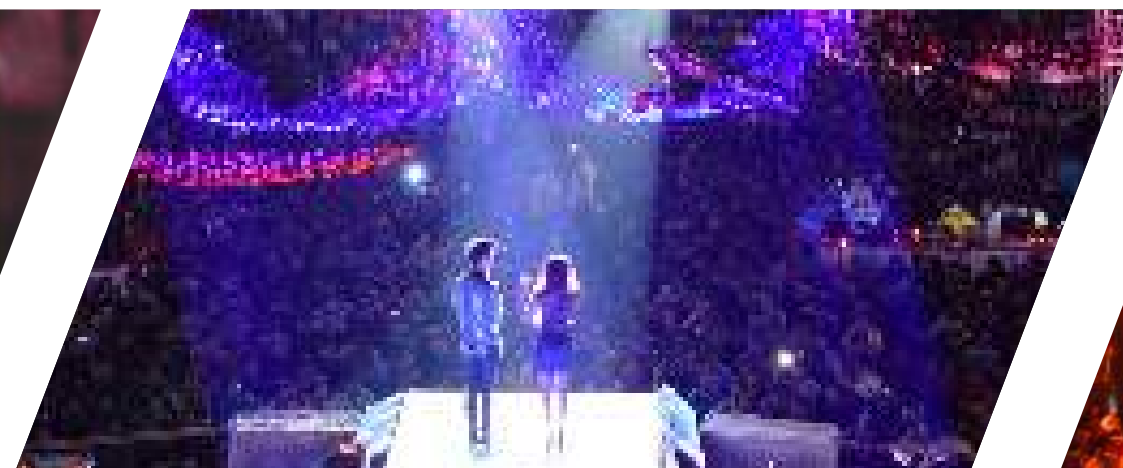
7500+ Crowd turnout Robowars, IIT Bombay