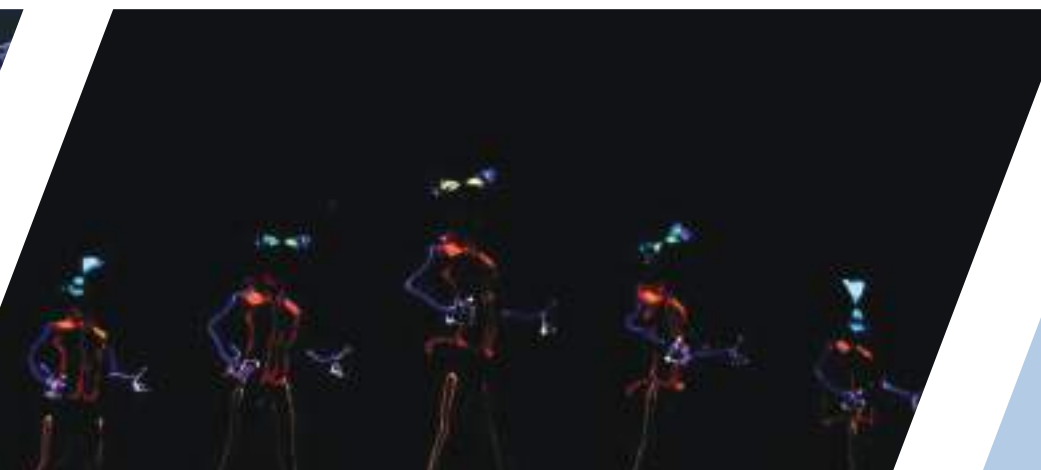
Skeleton Dance Crew India's Got Talent Semi Finalists