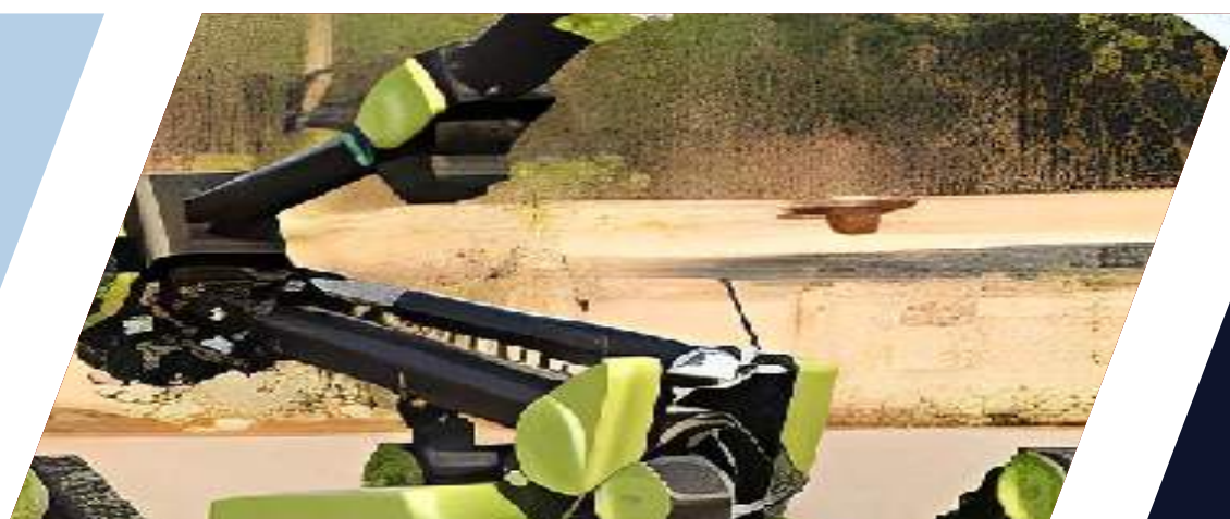
DRDO India's Premier R&D Organisation