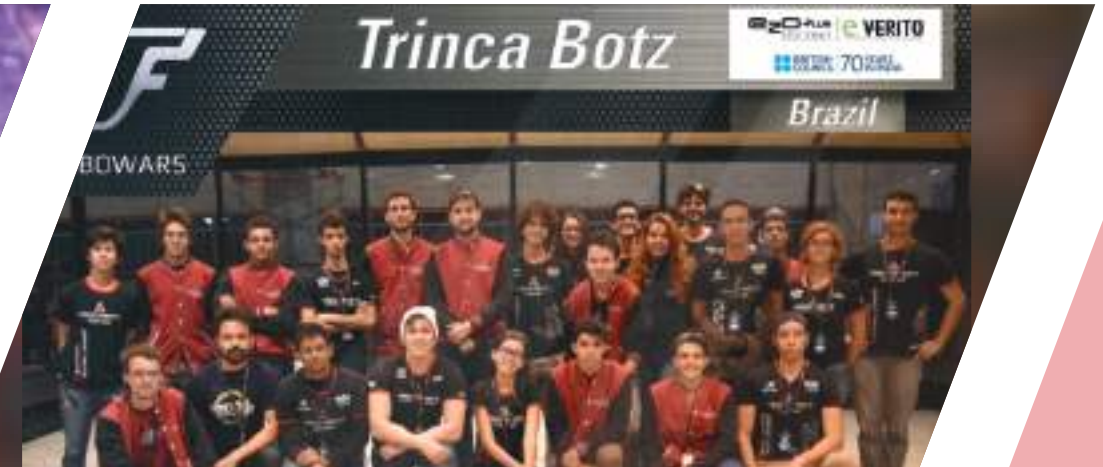
Huge Participation Dedicated year-long preparation