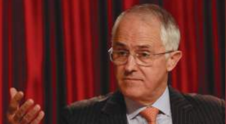
Malcolm Turnbull Former Prime Minister of Australia