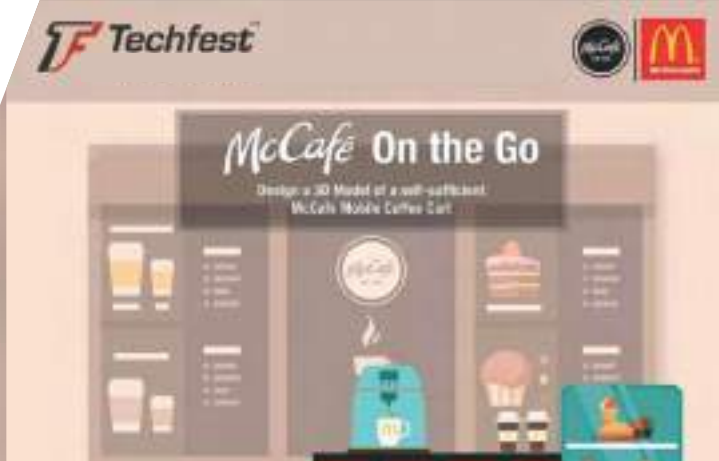
Prizes Worth Personalised Competitions