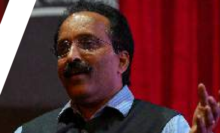
Shri S Somnath Chairman, ISRO