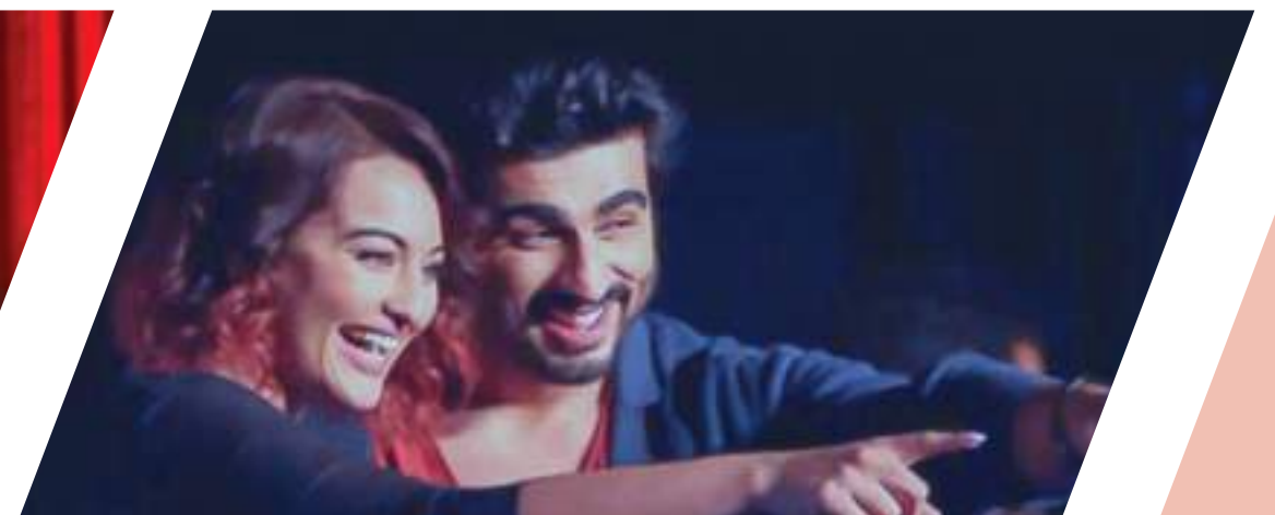
Sonakshi Sinha & Arjun Kapoor