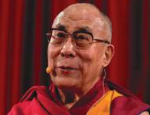
His Holiness The 14th Dalai Lama Nobel Peace Prize Laureate