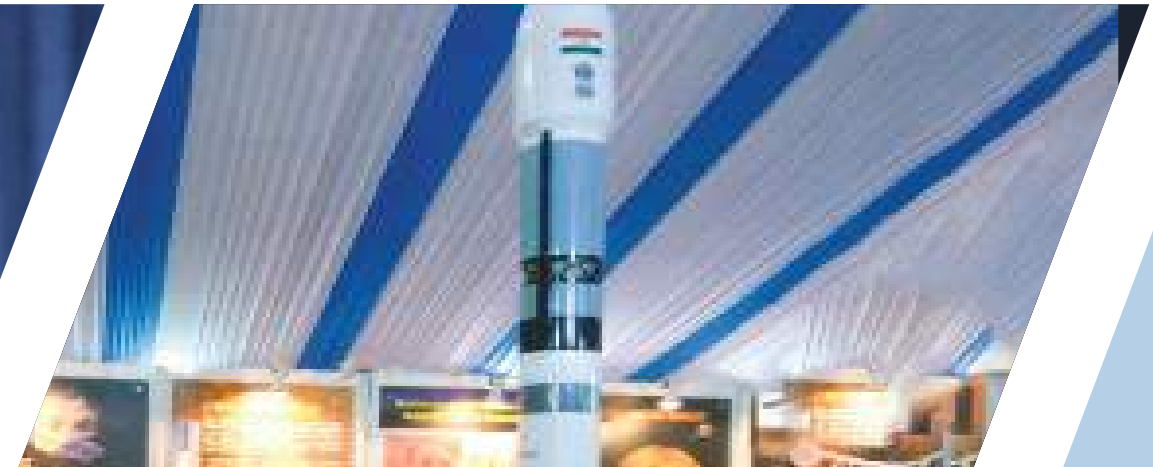
ISRO Advanced Space Research